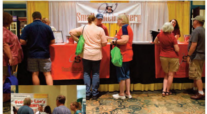
Visitors enjoyed samples of a variety of foods and beverages.